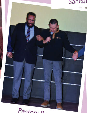
Pastors Prayer Breakfast 2025!