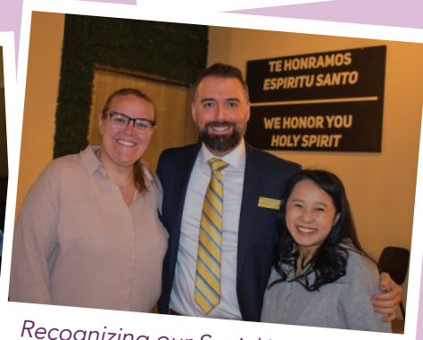
Recognizing our Social Workers for Social Work month in March. Thank you for serving our clients with care!