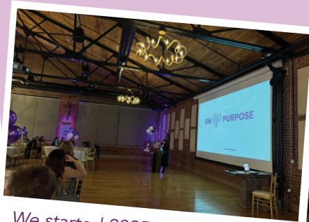
We started 2025 with our Capital Campaign Wrap-Up Event!