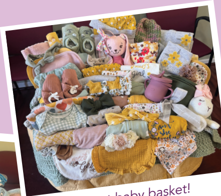
Recent baby basket!