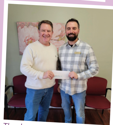
Thank you Cornerstone Church in Maiden for having us on Sanctity of Human Life Sunday!