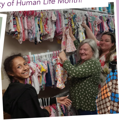
Thank you to the ladies from IChurch who helped us switch our store from winter to summer!