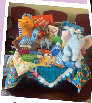
Recent baby basket!

Thank you to this amazing community. You give without measure, and we are truly thankful for your support.