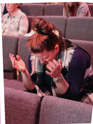
Pastors Prayer Breakfast 2025!