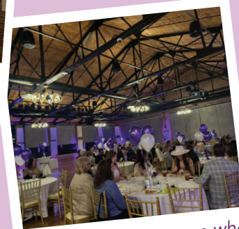
Thank you to everyone who participated in our Capital Campaign!

Thank you to this amazing community. You give without measure, and we are truly thankful for your support.