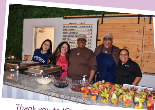
Thank you to IChurch for hosting our Annual Pastors Prayer Breakfast!